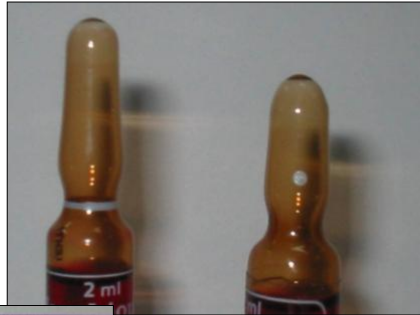
Picture courtesy of GSK, cannot be reproduced without written permission